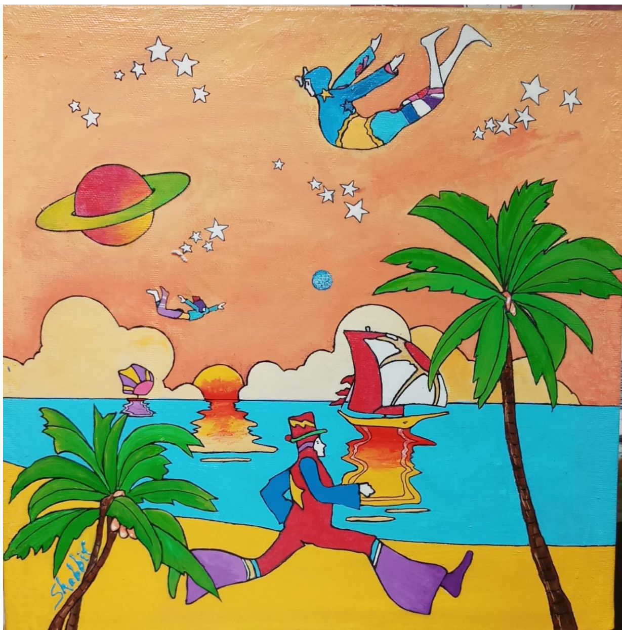
Medium: Acrylic on canvas Board